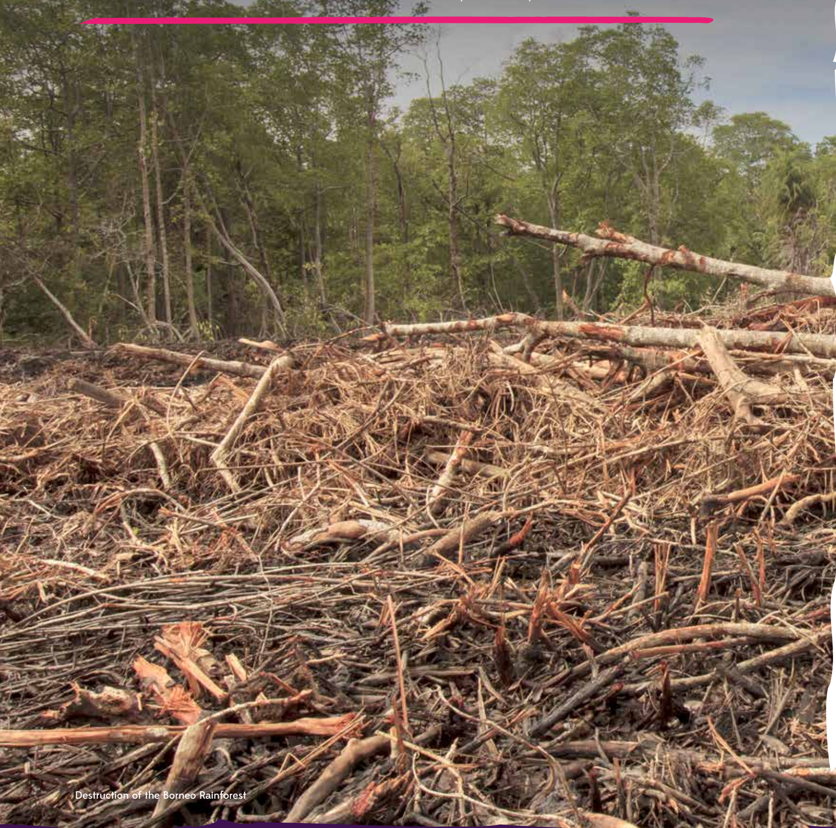
Destruction of the Borneo Rainforest

IPBES, Global Assessment Report on Biodiversity and Ecosystem Services