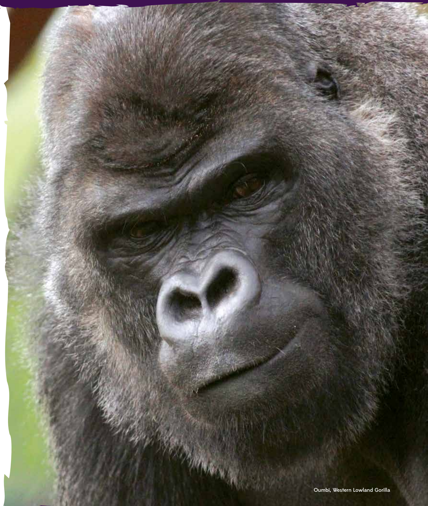
Oumbi, Western Lowland Gorilla

The centre will provide 30 bedrooms to ensure researchers and visiting professionals can stay if needed to complete longer functions and research projects.