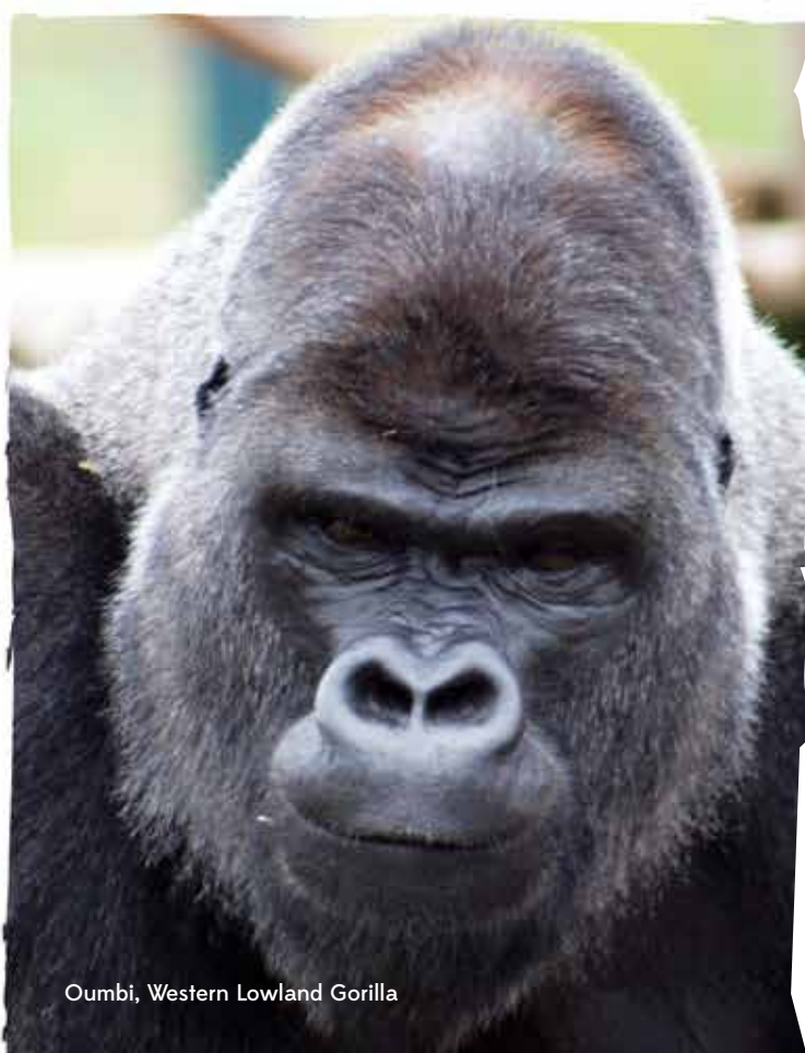
Oumbi, Western Lowland Gorilla