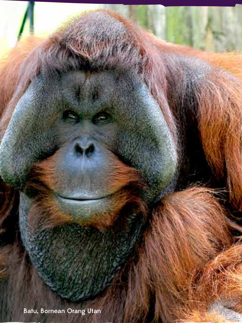
Batu, Bornean Orang Utan