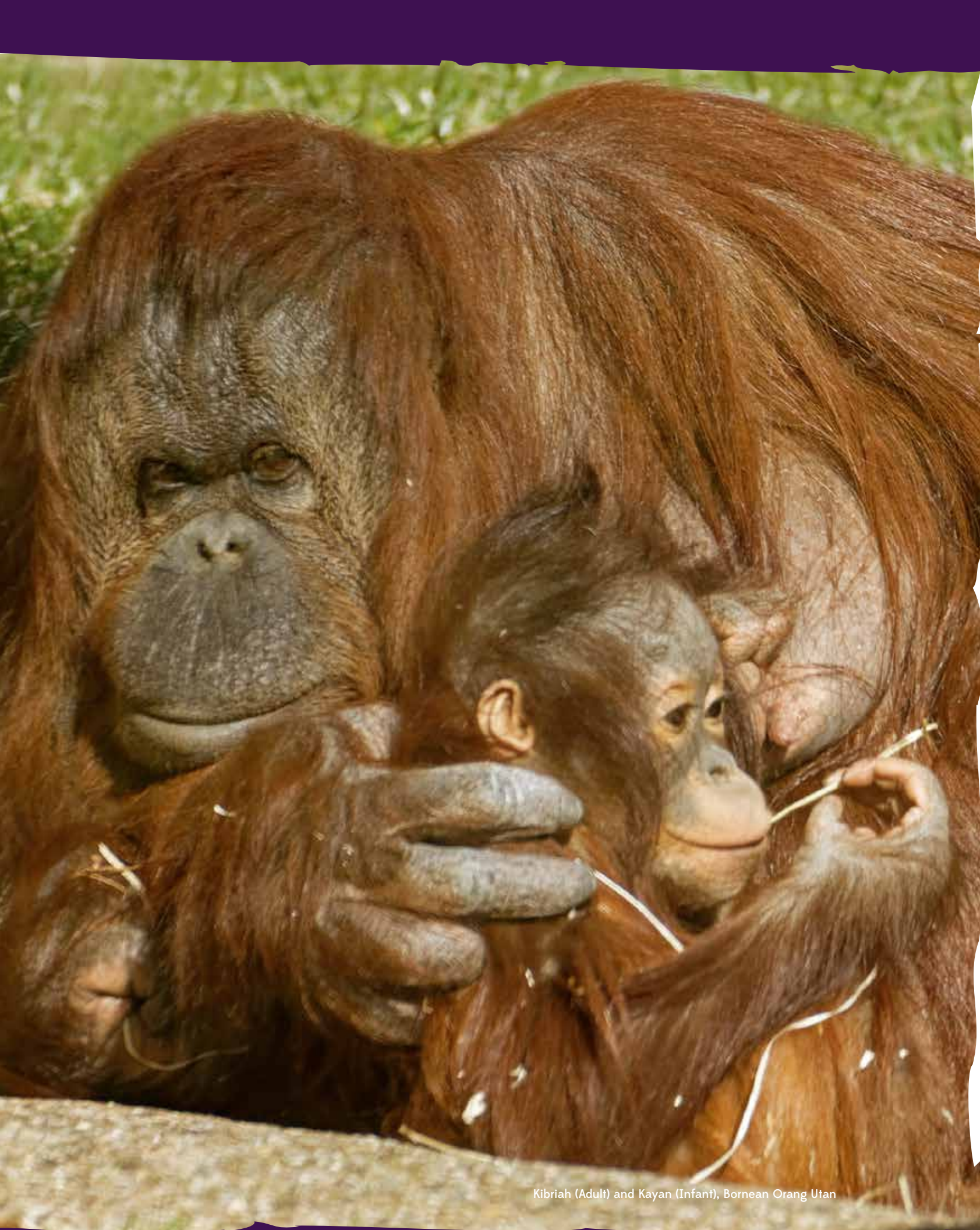
Kibriah (Adult) and Kayan (Infant), Bornean Orang Utan