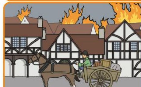
Carts were banned from going near the fire.