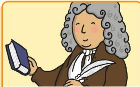
Samuel Pepys started to record the unfolding events in his diary.