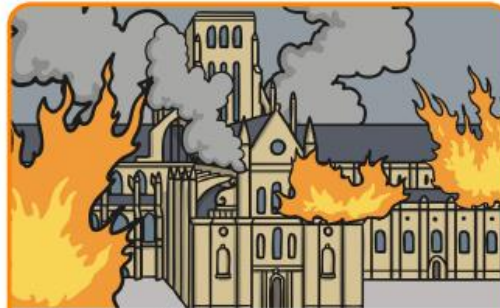
St. Paul's Cathedral was destroyed in the fire.