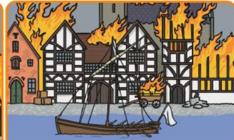
Buildings were very close together so the fire spread very quickly, especially with the added help of the wind! People had to carry their belongings to safety using boats on the River Thames.