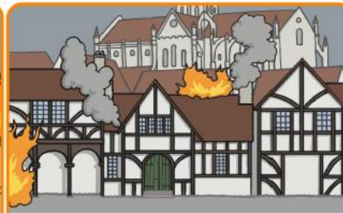
The fire started to burn more slowly as the wind died down.