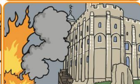
The fire spread very close to the Tower of London.