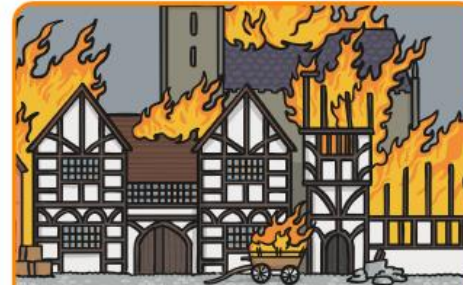
Fire services never used to exist so everyone had to use buckets of water to try and put the fire out! It destroyed many buildings, which were later rebuilt from brick instead of wood.