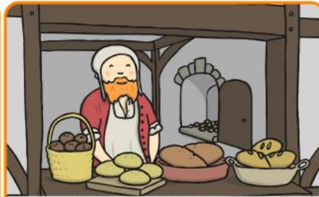
The famous "Great Fire of London" started on Sunday the 2nd September 1666 in a baker's shop on Pudding Lane. The baker was called Thomas Fariner.